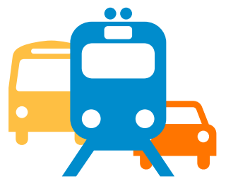
Provides Alternative Transportation Options